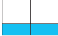
1/3 panorama page